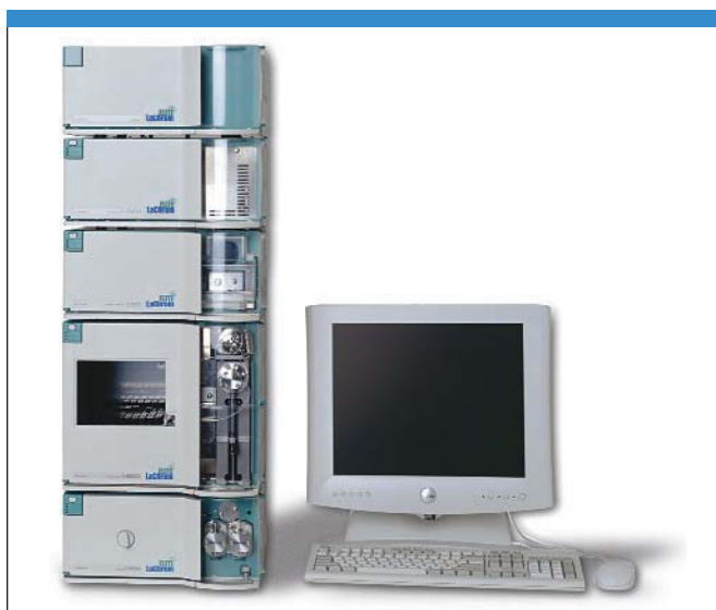
Figure 1: The Hitachi LaChrom Elite HPLC System