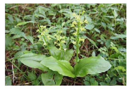
Wildflowers such as liparis kumokiri, which is becoming less frequently seen in the Kanto region, can be found growing here.