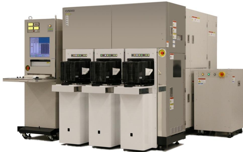
Advanced High Voltage CD-SEM CV5000 Series