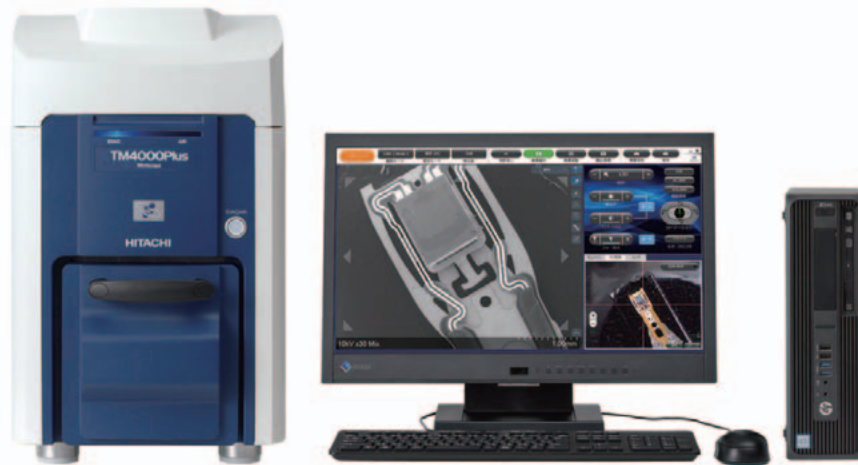
1 Miniscope tabletop microscope TM4000 Plus