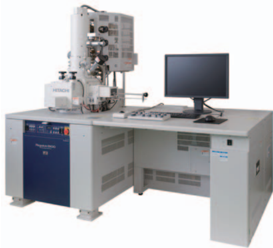
2 The Regulus8240

imaging capability. Moreover, SEMs must be able to consistently and reliably perform these functions. With optimized electron optical systems, the new Regulus series has increased resolution performance to 0.9 nm in the Regulus8220/8230/8240 models and 1.1 nm in the Regulus8100 model—an improvement of roughly 20% in resolution at 1 kV landing voltage compared with previous models. The Regulus series employs a novel cold-field-emission (CFE) gun optimized for high-resolution imaging at low accelerating voltages. This CFE gun makes it possible to observe high-resolution images of up to 2 million times* compared with 1 million times in previous models. User-support functions have also been enhanced so that the advanced performance of the series can be fully leveraged, including functions to assist