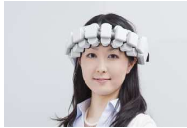
Applied optical topography technology