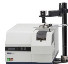
Thermo Gravimetry/ Differential Thermal Analyzer with Optical Observation Function STA7220

Real time observation of the sample is very effective to the data interpretation of TG/DTA.