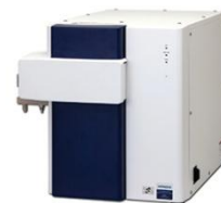
5610 MS Detector

Chromaster 5610 MS Detector is a mass detector with new concept, designed for LC users, and it is different from conventional mass spectrometers. Organic acids greatly affect the tastes and flavors of foods and therefore, are frequently analyzed for the purpose of research and development, quality control, etc. In addition to food products, various products such as drugs, culture liquids, plating solutions, and cosmetics are being analyzed. This time, six organic acids are separated by using a HILIC column and detected by Chromaster 5610 MS detector, and the example is introduced here.