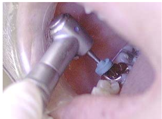
Photo 2 Oral collection process