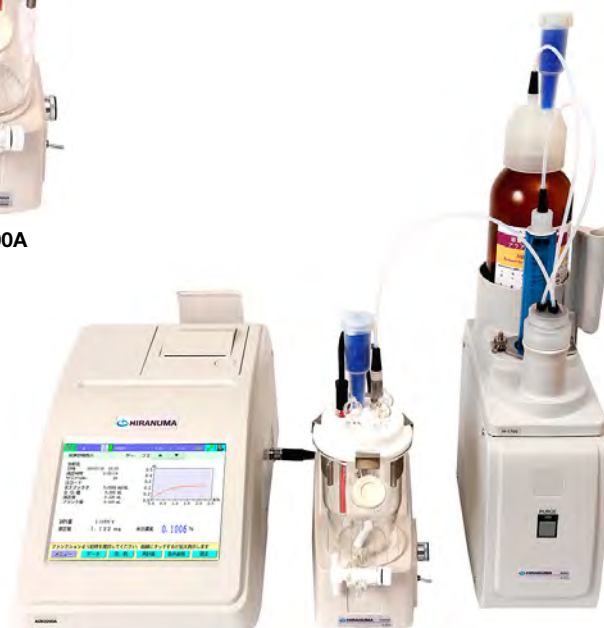
The Automatic Volumetric Karl Fischer Titrator AQV-2200A