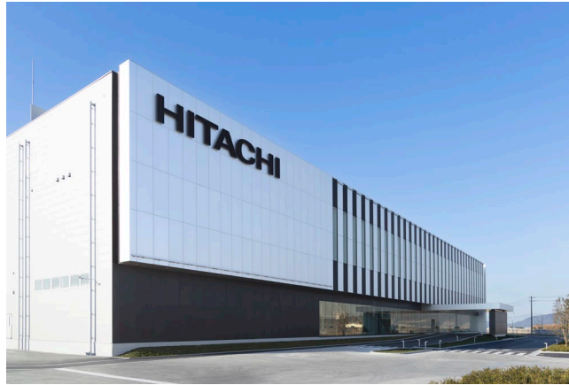
Exterior of new production facility

Tokyo, March 31, 2025 – Hitachi High-Tech Corporation ("Hitachi High-Tech") announced that the new production facility for semiconductor manufacturing equipment (etch systems), which had been under construction since December 2023 in the Kasado area (Kudamatsu City, Yamaguchi Prefecture), was completed and started the operation on March 17, 2025.